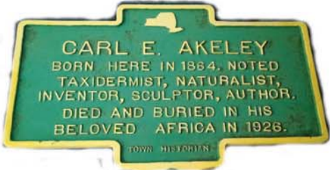
Carl Akeley was born in Clarendon and raised on Hinds Road